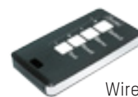
Wireless remote control